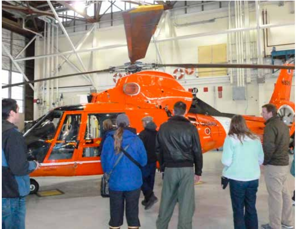
Participants tour Coast Guard Air Station Kodiak in conjunction with the Alaska Chapter AFS meeting at Kodiak in October 2012.

The tentative schedule includes continuing education workshops, and organized tours will be held on the first two days of the meeting (October 7 and 8) and a welcome reception will be held Tuesday evening, October 8. The keynote