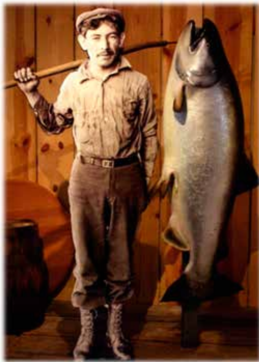
Largest known Chinook salmon in the world (126.5 lbs), caught in a fish trap off Prince of Wales Island, Southeast Alaska in 1938 and currently mounted for display next to a cardboard cutout.

Traditional and local knowledge concerning historical and emerging fishing practices are also important areas of inquiry to help disentangle the Chinook salmon production enigma. One example is the reduced gillnet mesh size recently adopted for the Yukon to protect larger fish that were traditionally targeted with large mesh. What changes have occurred over time in other fisheries? One development in sport and charter fisheries has