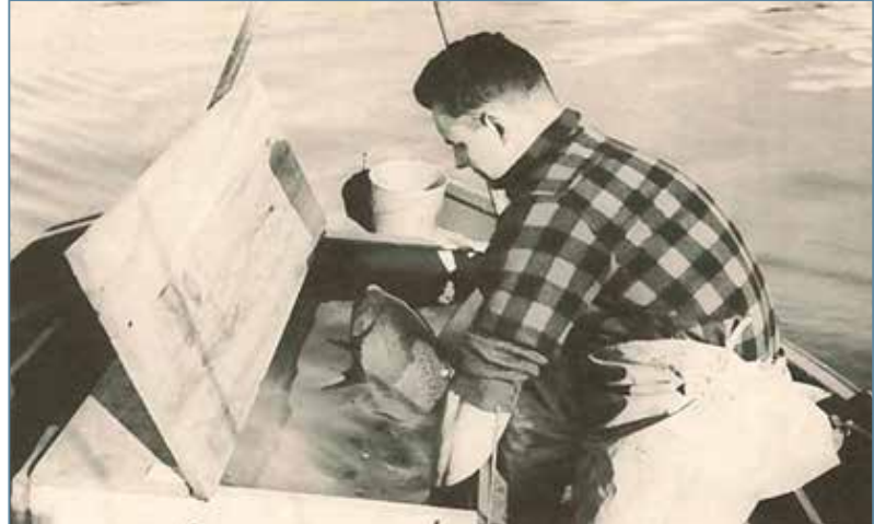
Early Chinook salmon tagging off commercial salmon troll vessels to validate the origin of fish harvested off Southeast Alaska, circa 1950.