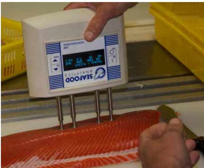
Collecting BIA measures from a salmon filet.