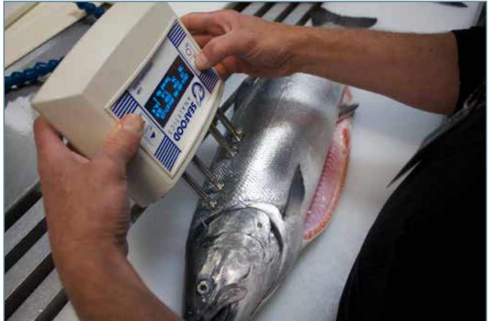
Sampling a salmon for bioelectrical impedance analysis.