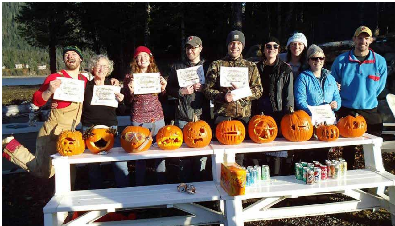
Juneau students and advisors at the 4th Annual Spooktacular Dive and Underwater Pumpkin Carving Competition.