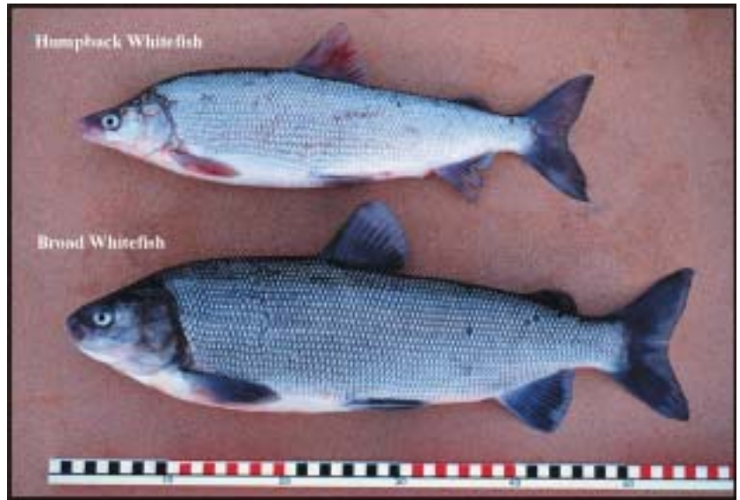
An adult humpback and broad whitefish.