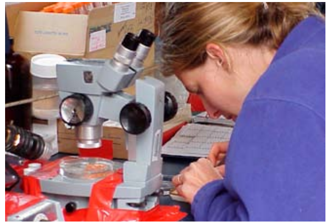
A biologist prepares gorgonian coral specimens for examination of their reproductive biology

habitat, has sparked worldwide interest in the conservation of deep-sea corals. As the world population continues to grow and the demand for seafood increases in the future, conservation of Alaska's deep coral resources will be a major challenge for managers striving to maintain sustainable fisheries. The Magnuson-Stevens Fishery Conservation and Management Reauthorization Act of 2006 includes, for the first time, a Deep Sea Coral Research and Technology Program that paves the way to achieve that goal. To learn more about Alaska's coral resources and current and planned research download a copy of the just released "The State of Deep Coral Ecosystems of the United States: 2007" from http://www.nmfs.noaa.gov/habitat/dce.html .