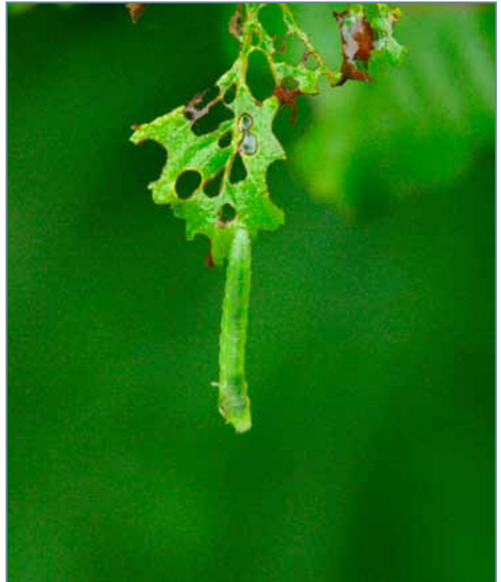
Terrestrial insects inhabit riparian forests and fall prey to stream fishes.