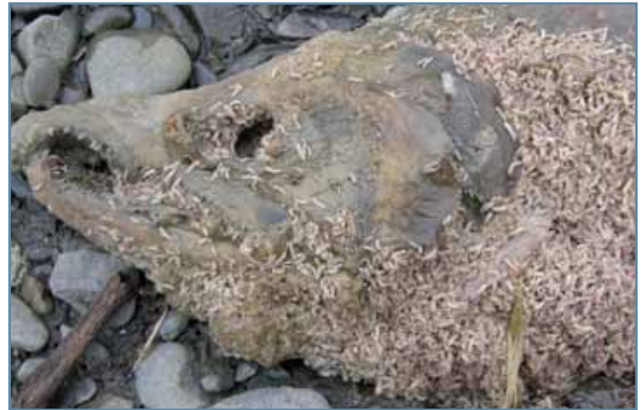
Fly maggots quickly transform dead salmon into insect biomass, which in turn are prey for fishes.

Eggs from spawning salmon and fragments of flesh from rotting, post-spawning salmon are also food for young salmon and other fishes, and augment growth and condition of fishes that feed