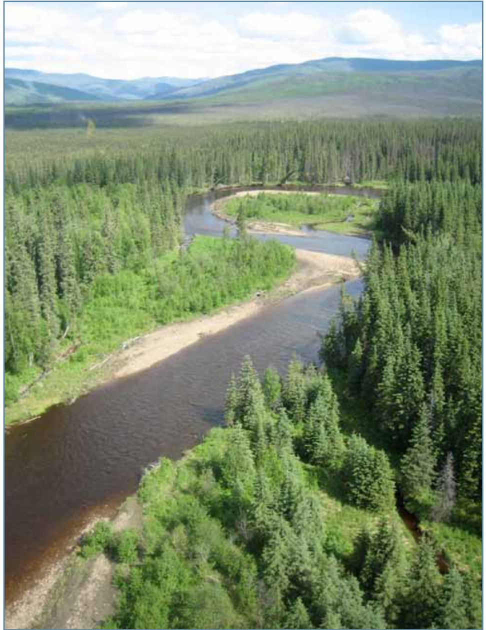
Upper Chena River.

biota require both shelter and nourishment, suitable habitat must also include reliable supplies of suitable food. In fact, recent studies in Alaska and the Pacific Northwest have shown that food abundance and quality may in part drive salmonid populations and productivity in freshwater ecosystems.