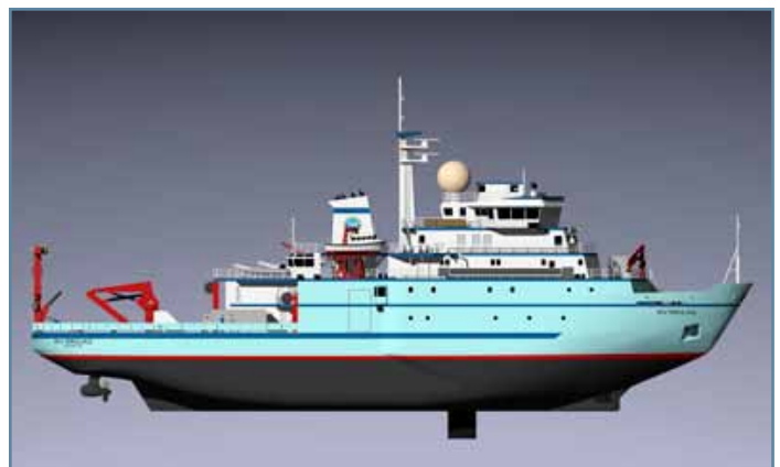
Marine Architects rendering of the R/V Sikuliaq, currently under construction for the University of Alaska, Fairbanks.

column and sea bottom using an extensive set of research instrumentation. The ship will also be able to transmit real-time information directly to classrooms all over the world. The vessel design strives to have the lowest possible environmental impact, including a low underwater radiated noise signature for marine mammal and fisheries work. The Sikuliaq will have accommodations for up to 26 scientists and students at a time, including those with disabilities. 🐼