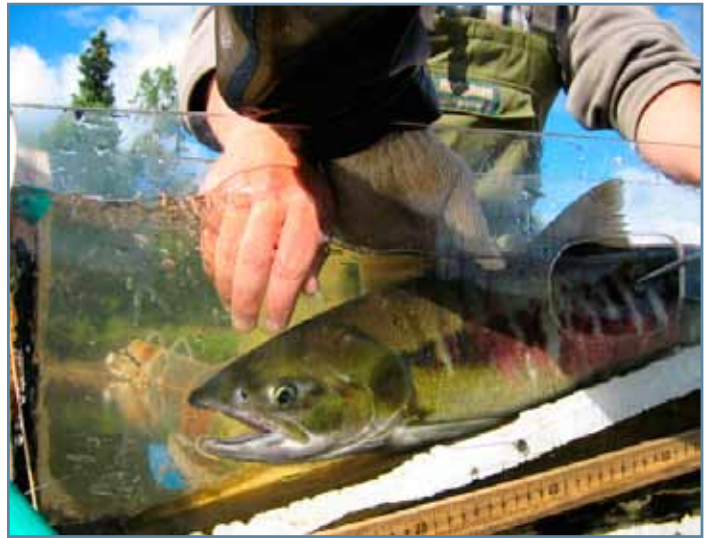
Biologists sample returning chum salmon.

The basic mission of BSFA follows several core concepts. First, it is recognized fisheries sustainability is key to supporting and developing fisheries programs. Western Alaska's interests are focused on the long-term, and the BSFA has a notable history of developing effective conservation measures and innovative economic development initiatives on levels appropriate to the resource base. A second concept involves the benefits of collaborative partnerships. When