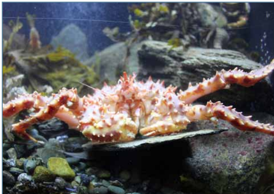
Red king crab observing Chapter members during the opening social at Ladd Macaulay Hatchery.

The membership statistics were somewhat higher for 2010 than for 2009 through the September reporting period (see table). Although the number of active members is down slightly from 2009, the number of AFS life, retired, student, and young professional members have each increased over the past year. Overall, total membership has been on an upward trend over the past three years. In addition, the number of delinquent dues members (members who have not paid their membership dues) is down from 2009. It should be noted that the category of Alaska Chapter life member was new in 2010.