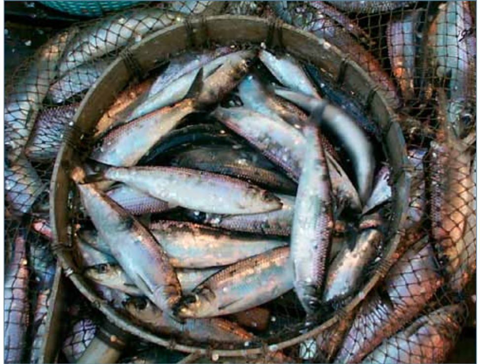
Brailer of Togiak herring.