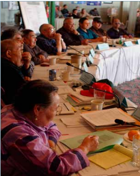
Gathering of stakeholders.