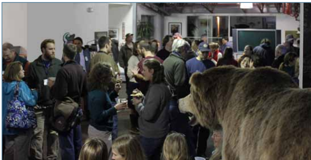
Opening social at Ladd Macaulay Hatchery.